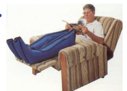
Foot and Leg Therapy

OVER THE SHOULDER • ADJUSTABLE • CUSTOM • AMPUTEE